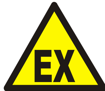
Fig. 1 Sign indicating where explosive atmospheres may occur. (ATEX 137, Annex III)

ATEX 137 Article 7 and Annex I, require that hazardous areas be classified and allocated zone coding. Such areas need to be identified with a new mandatory sign (Fig. 1).