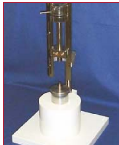
BAM Fallhammer Apparatus